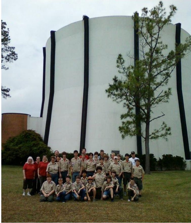
A group of scouts outside the Nuclear Science Center during a Merit Badge Workshop.