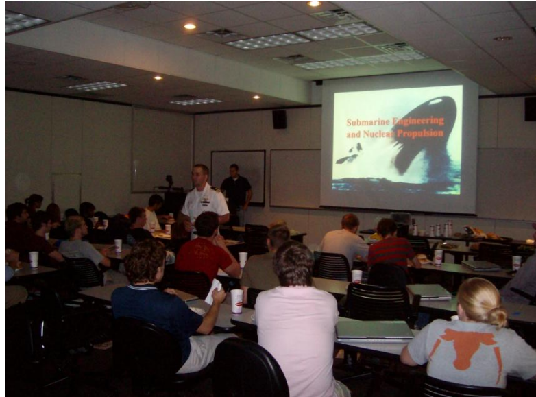
Lt. Turner describing life and opportunities in the U.S. Navy.