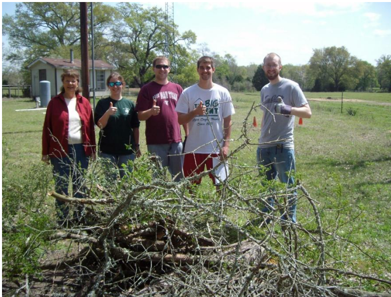
TAMU-ANS members with a family member at a Big Event job site.

TAMU-ANS participated in the Big Event held in the Bryan-College Station area. The Big Event is the largest one day community service event in the nation, and is held annually in the spring. TAMU-ANS is proud to be able to serve our community by participating in this event.