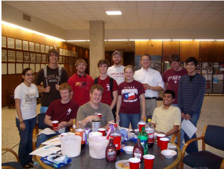
Mentors and Mentees at the TAMU-ANS Mentor Ice Cream Social.

TAMU-ANS continued its mentoring program this year. First year students were paired with upperclassman and graduate mentors. Mentors were required to contact their mentees and check up with them periodically throughout the year. TAMU-ANS hosted a Mentor Ice Cream Social and other events to encourage participation in the program.