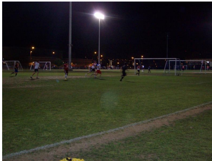
ANS Soccer IM team going for a goal!