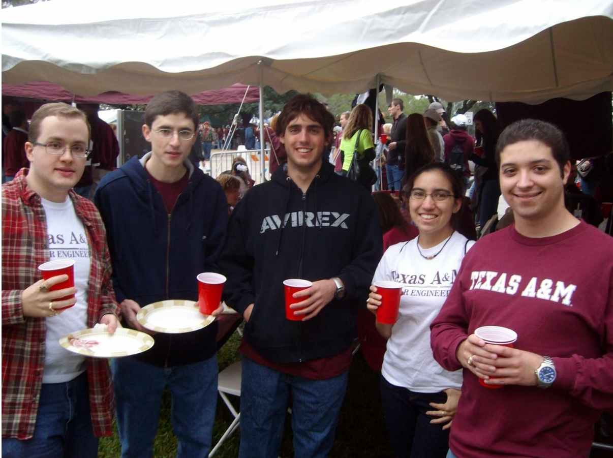
TAMU-ANS members at a tailgate party before a home football game.

In conjunction with the fall meeting of our Departmental Advisory Council, TAMU-ANS coordinated a tailgate party in conjunction with the home football game. The tailgating was successful with around 100 members participating. Food and drinks were provided.